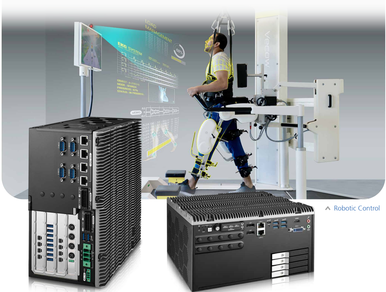
▲ Robotic Control

Intel® Core™ i9/i7/i5/i3 Processor (14th Gen) Flexible AI Inference Workstation